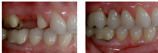
A Lava bridge in position in the mouth

Unlike conventional crowns and bridges with metal-based cores, 3M™ ESPE™ Lava™ Restorations contain absolutely no metal so you will see no dark lines where your tooth meets the gum.